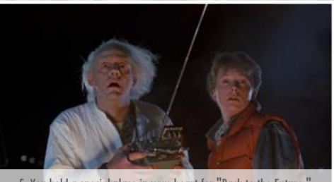
5. You hold a special place in your heart for "Back to the Future."