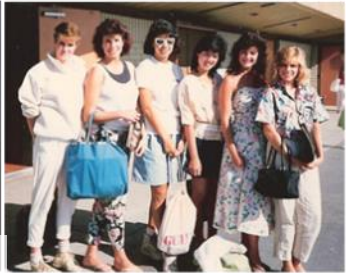
6. You fell victim to 80's fashion: big hair, crimped, combed over to the side, big hoop earrings, and possibly the worst: you wore spandex pants.